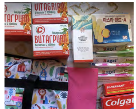
Contents of a hygiene kit