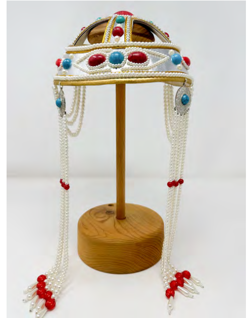
Traditional Mongolian woman's headdress

Clothing. We have acquired children's traditional clothing from Mongolia, including deels, hats, and shirts. We are looking for an organization that could make good use of these items, either for educational purposes or cultural exchange. Do you know any school or non-profit which might be interested?